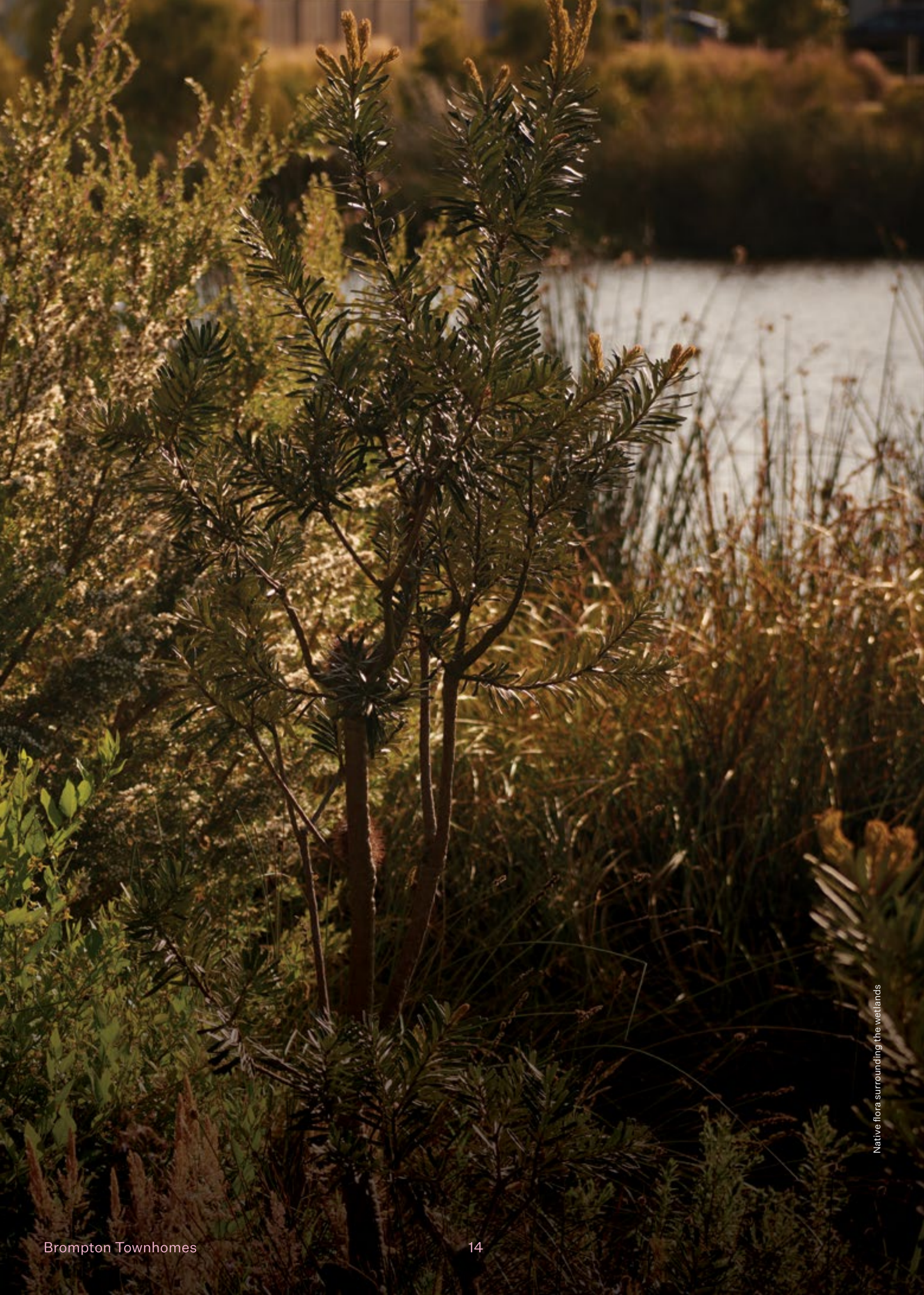
Native flora surrounding the wetlands