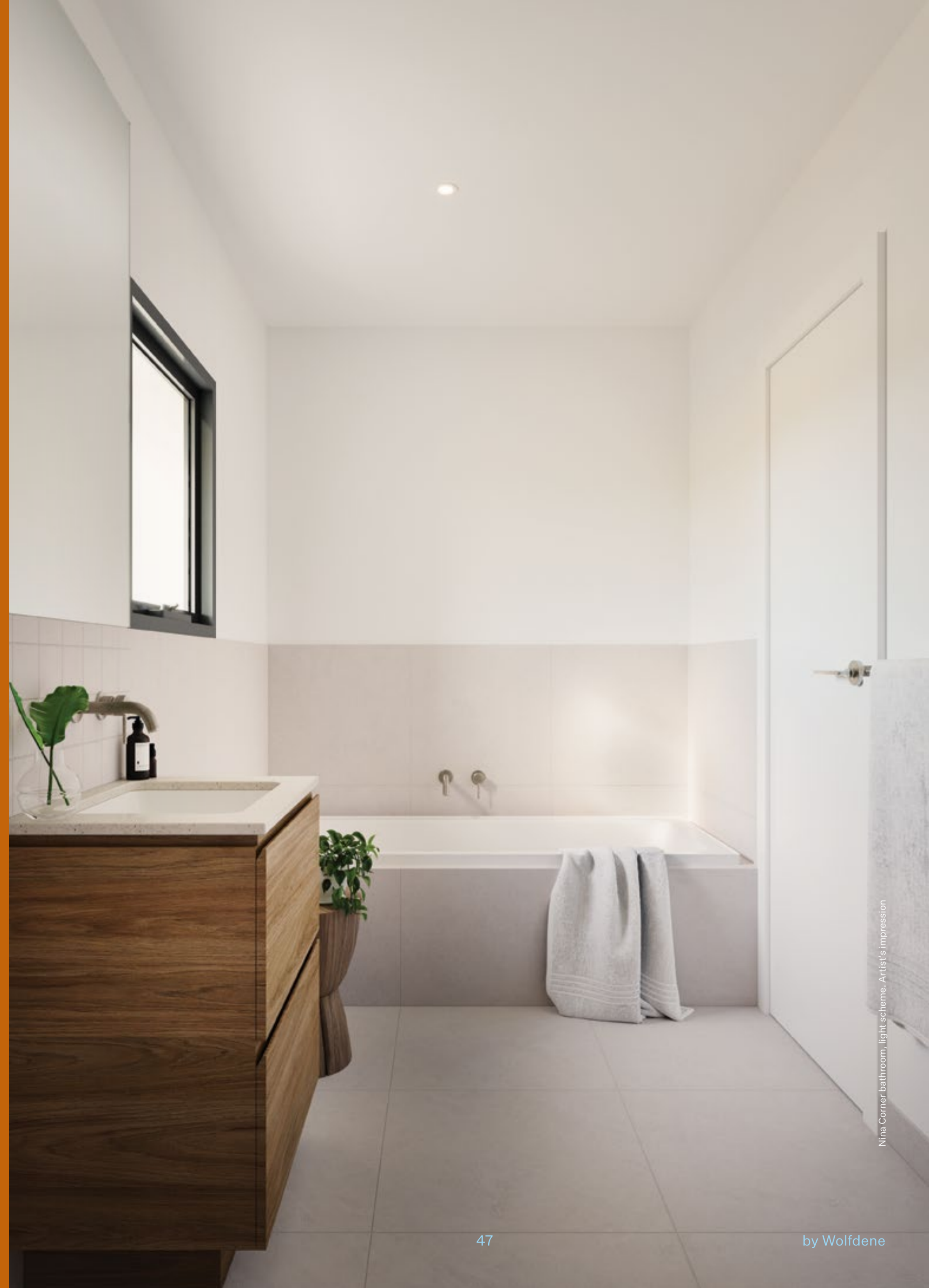
Nina Corner bathroom, light scheme. Artist's impression