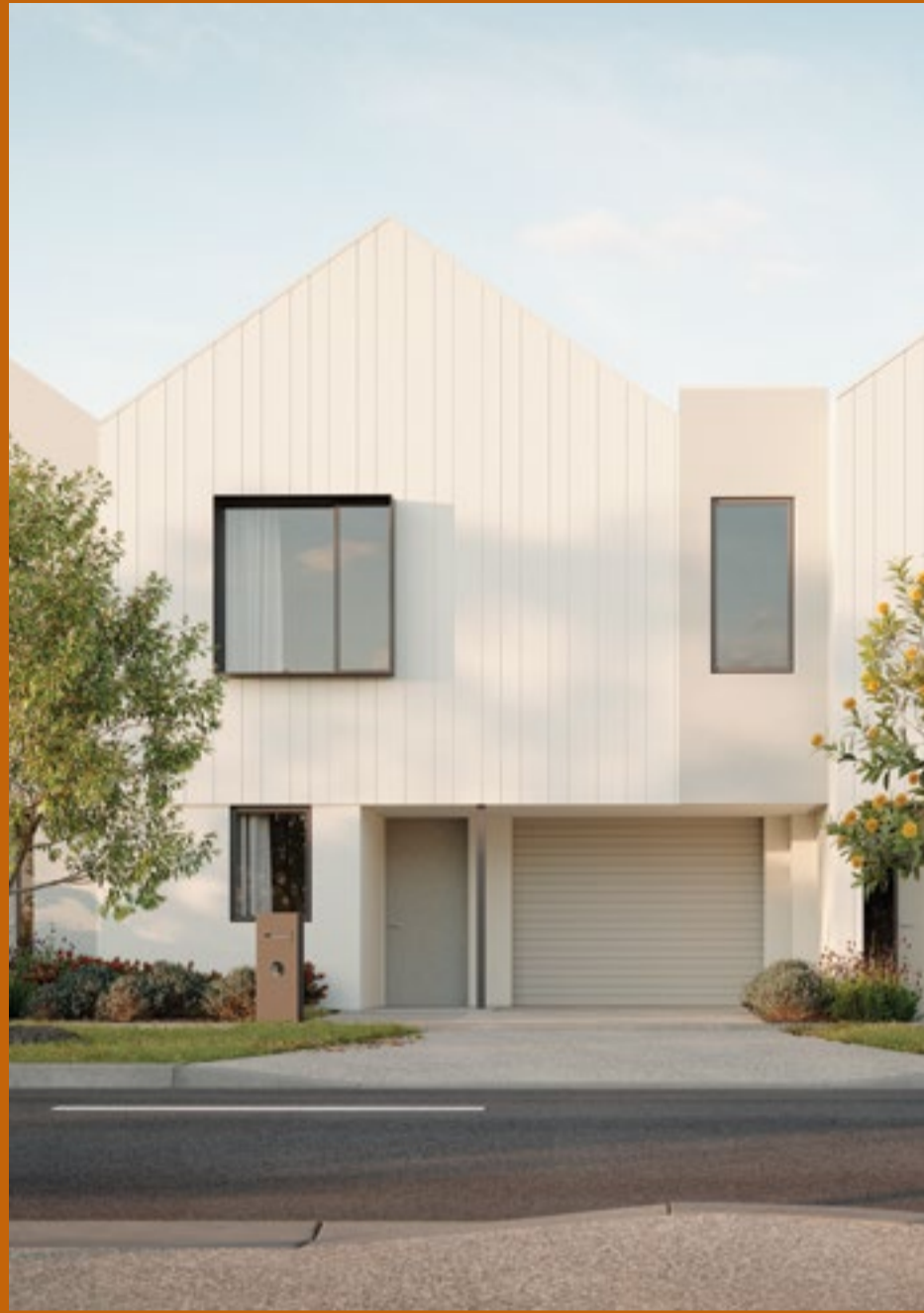
Elliot exterior. Artist's impression