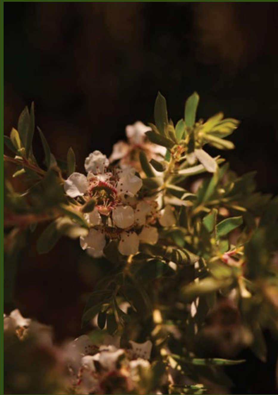
Local pocket parks and reserves