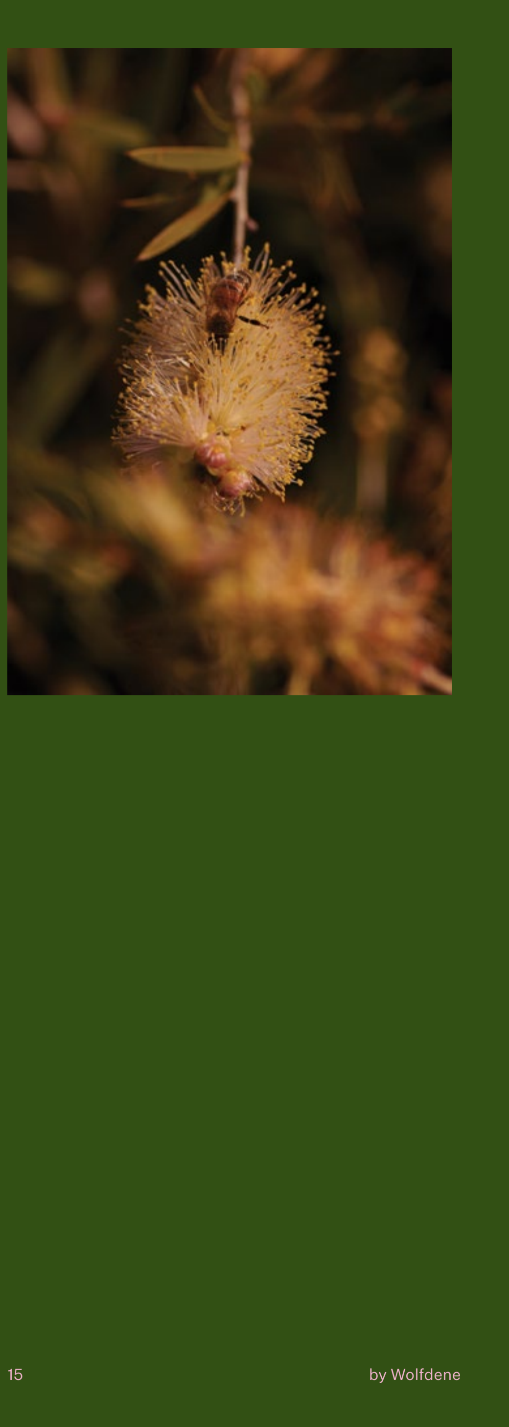
Native flora surrounding the wetlands