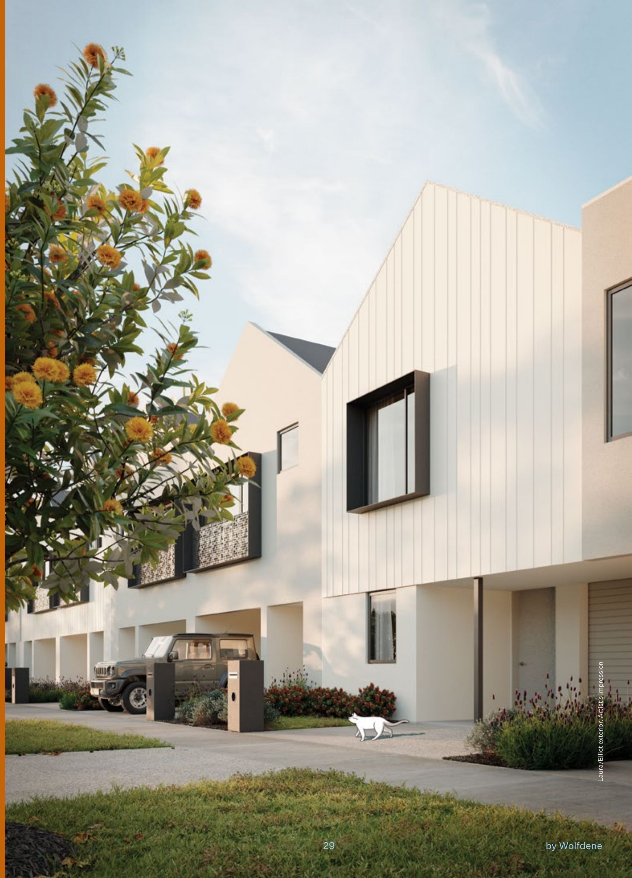
Laura/Elliot exterior. Artist's impression