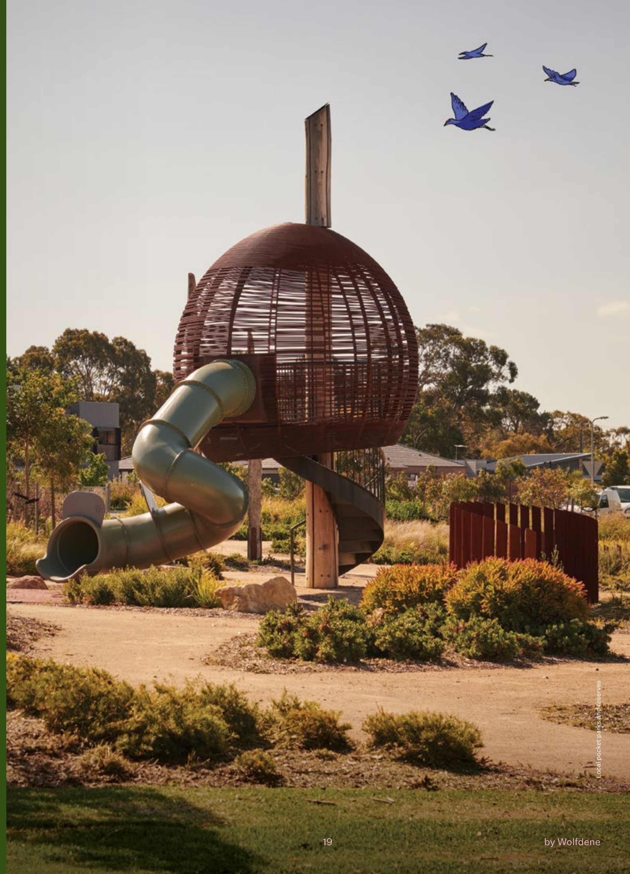
Local pocket parks and reserves