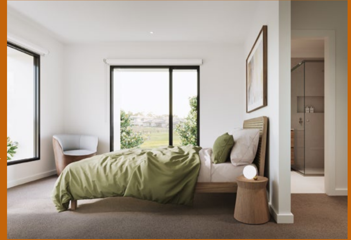
Nina Corner bedroom - Artist's Impression