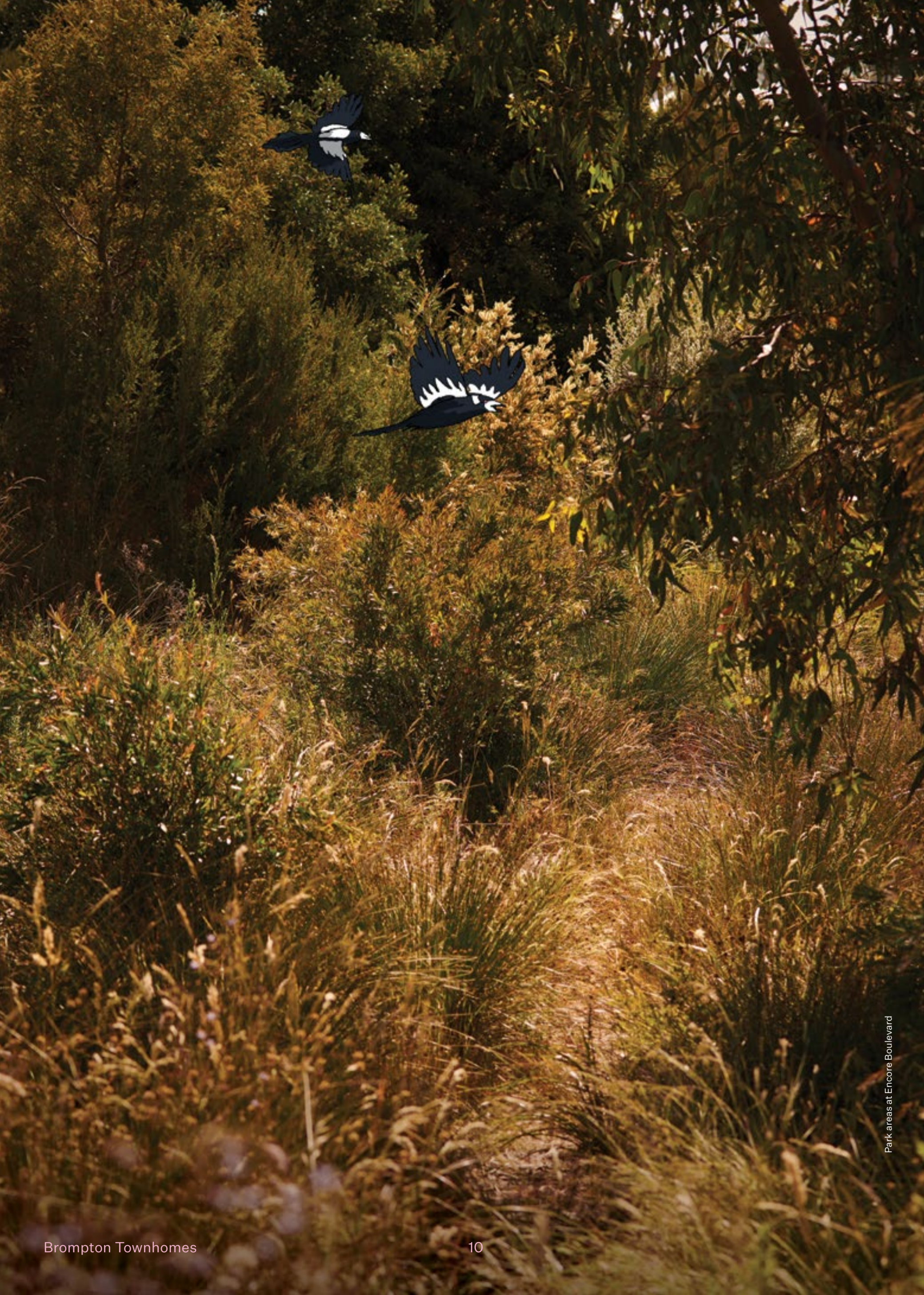
Park areas at Encore Boulevard